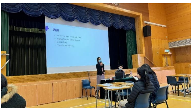
Workshop on Growth Mindset and Positive Thinking for all teachers, Teachers' Development Day at Elegantia College, 21 Dec. 2021