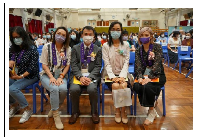
Officiating guest of the election of Parentteacher Association, Buddhist Tai Hung College (30 Oct. 2021)