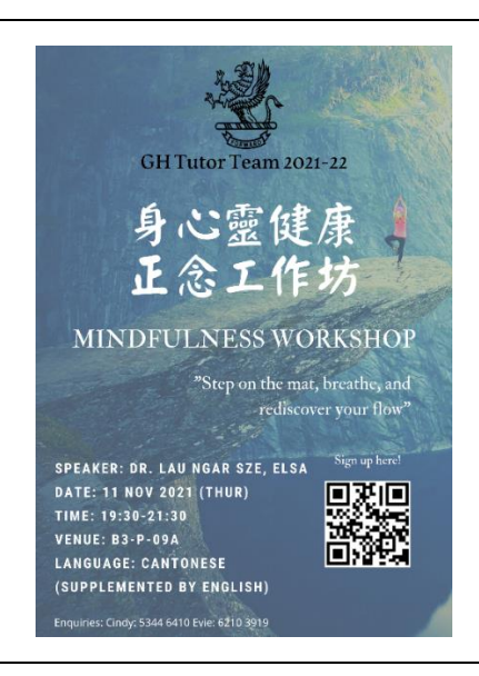
Invited mindfulness workshop on 11 Nov. 2021