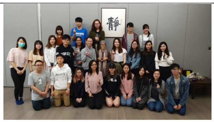
Mindfulness, Resilience and Compassion (MRC) Project, training for in-service teachers of Elegantia College (29 Oct 2019)